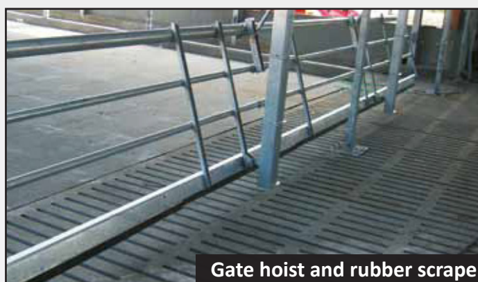
Gate hoist and rubber scrape