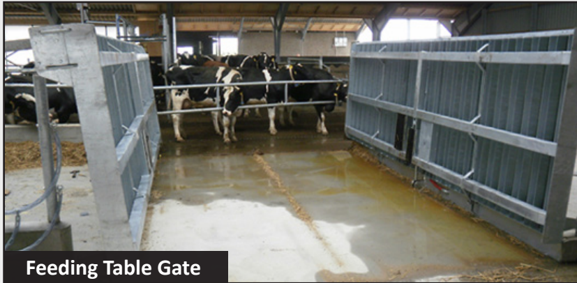
Feeding Table Gate

With the most carefully constructed Feeding Table gate on the market you achieve: